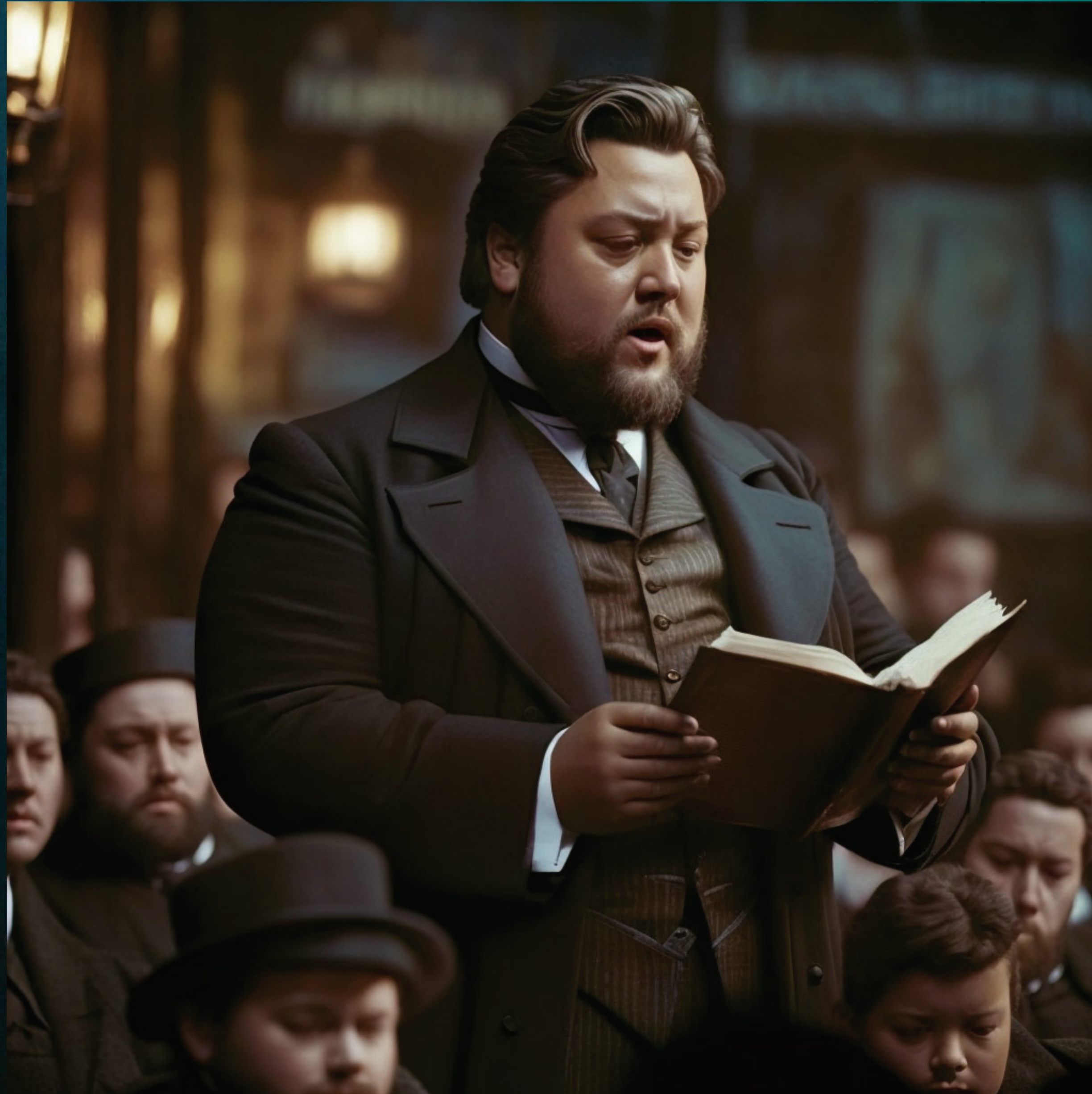
Charles H Spurgeon Rendering