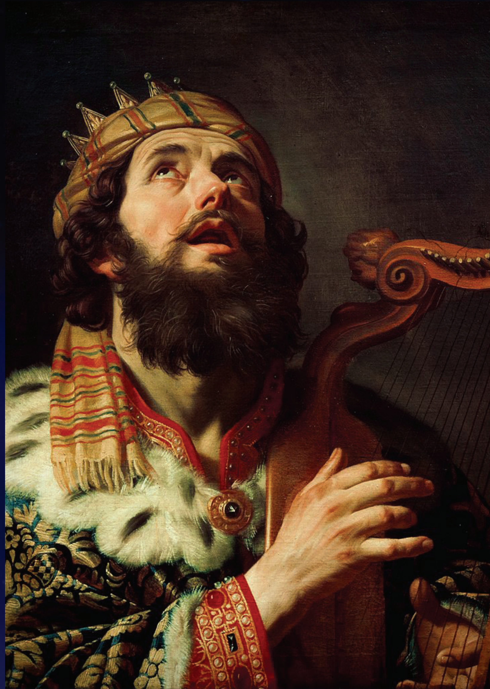
King David Playing the Harp (1622) by Gerard van Honthorst