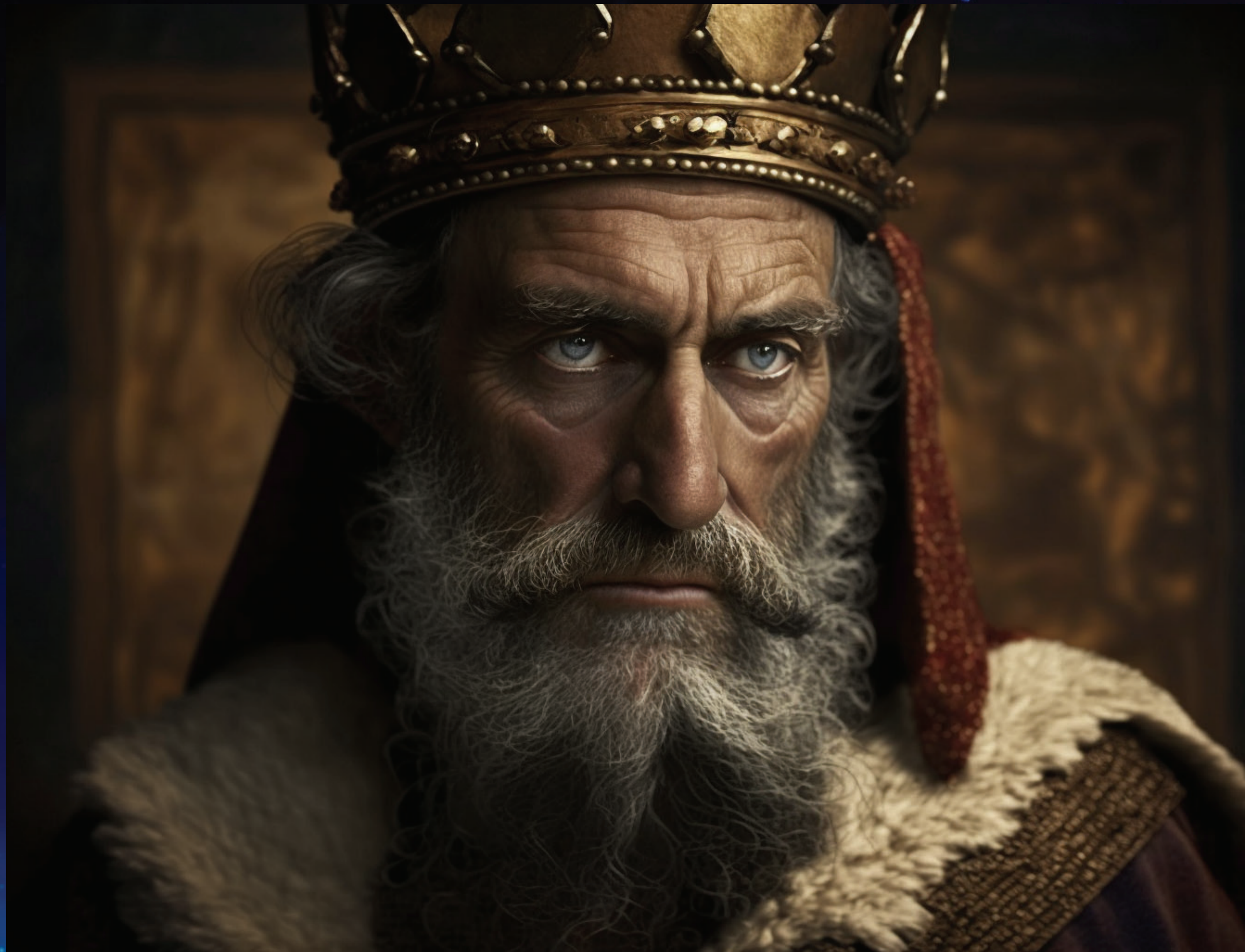
King Herod the Great