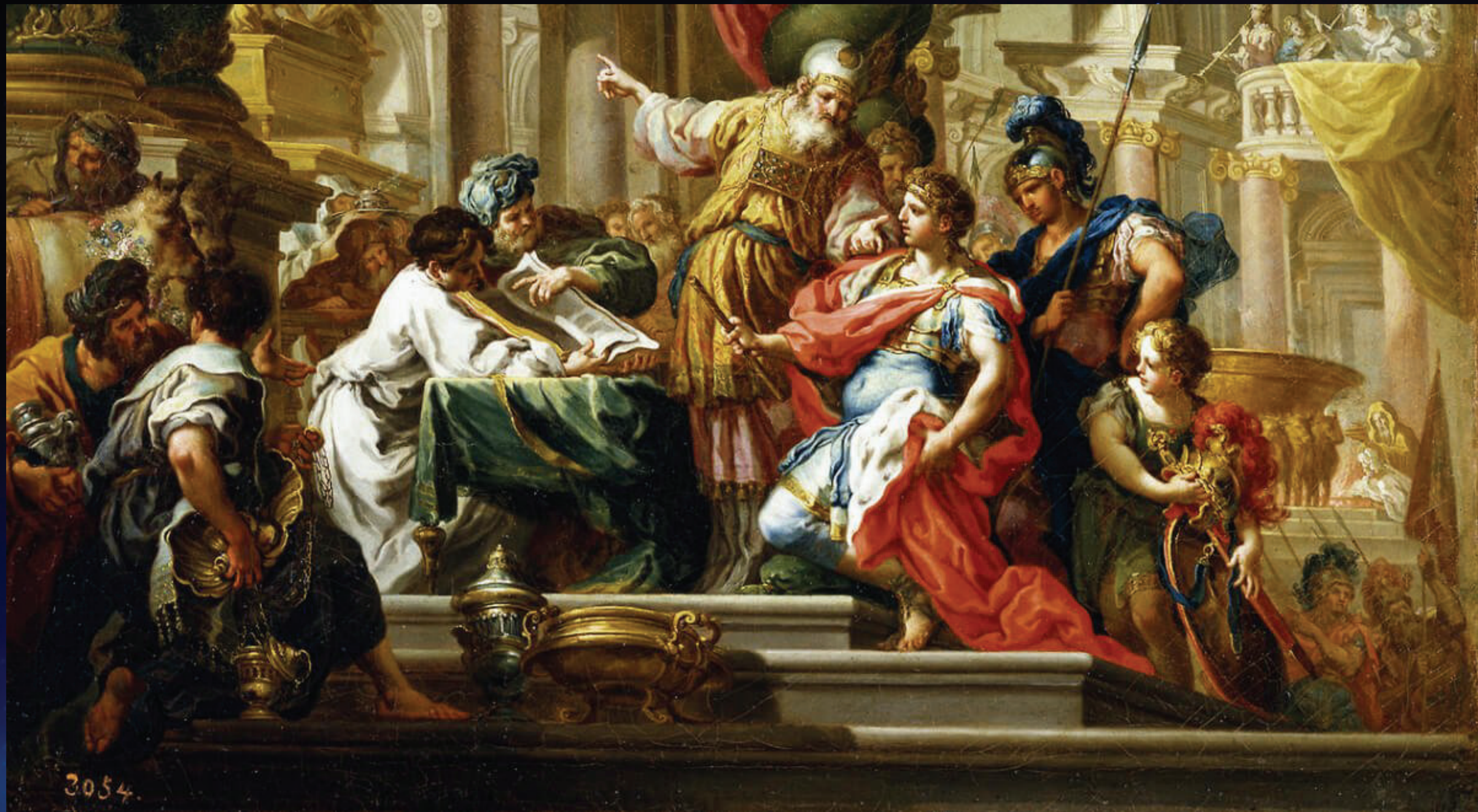
Alexander the Great in the Temple of Jerusalem 1736 Sebastiano Conca