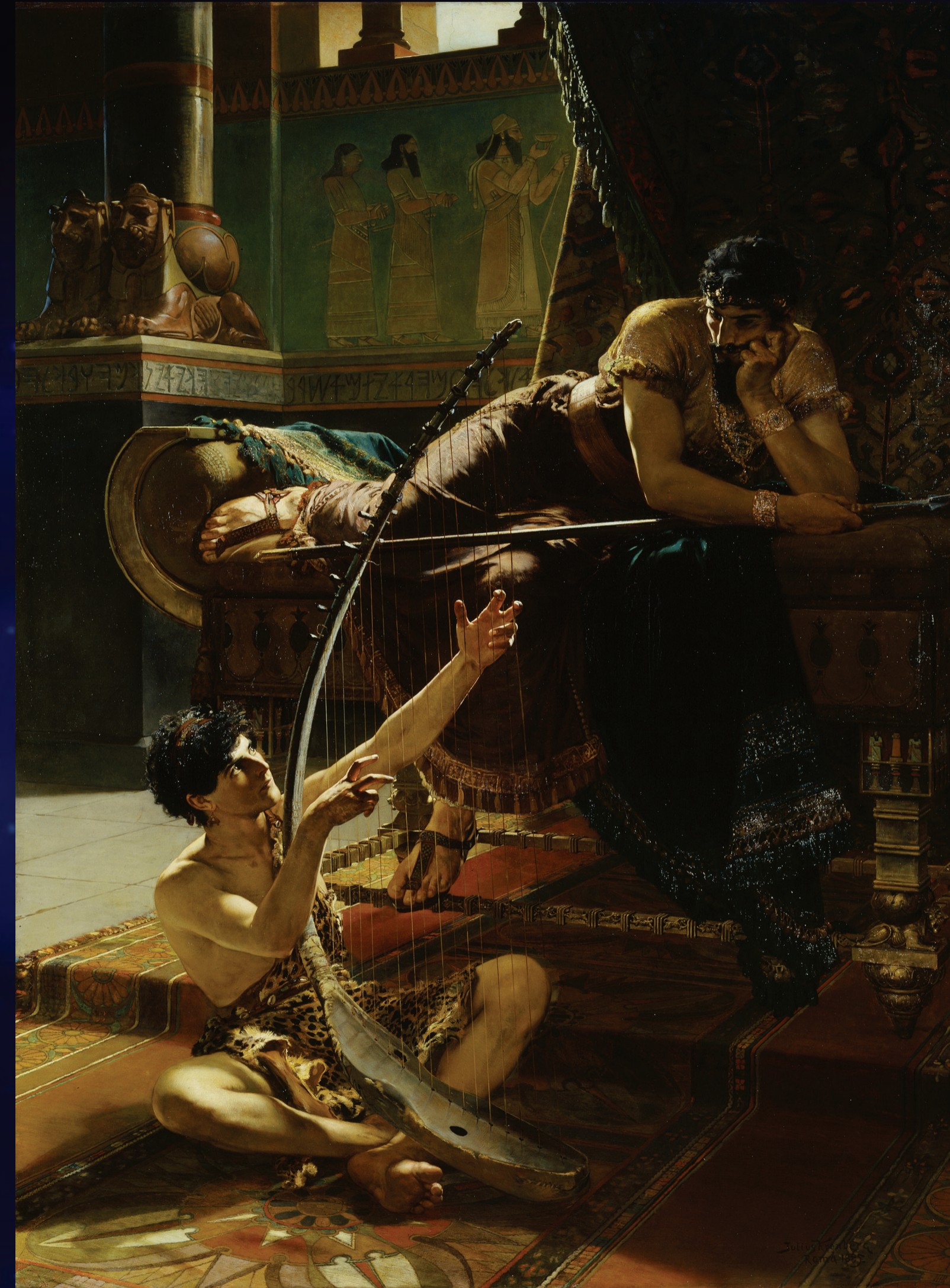
King Saul (1878) Ernst Josephson & David playing Harp for King Saul (1885) by Julius Kronberg.