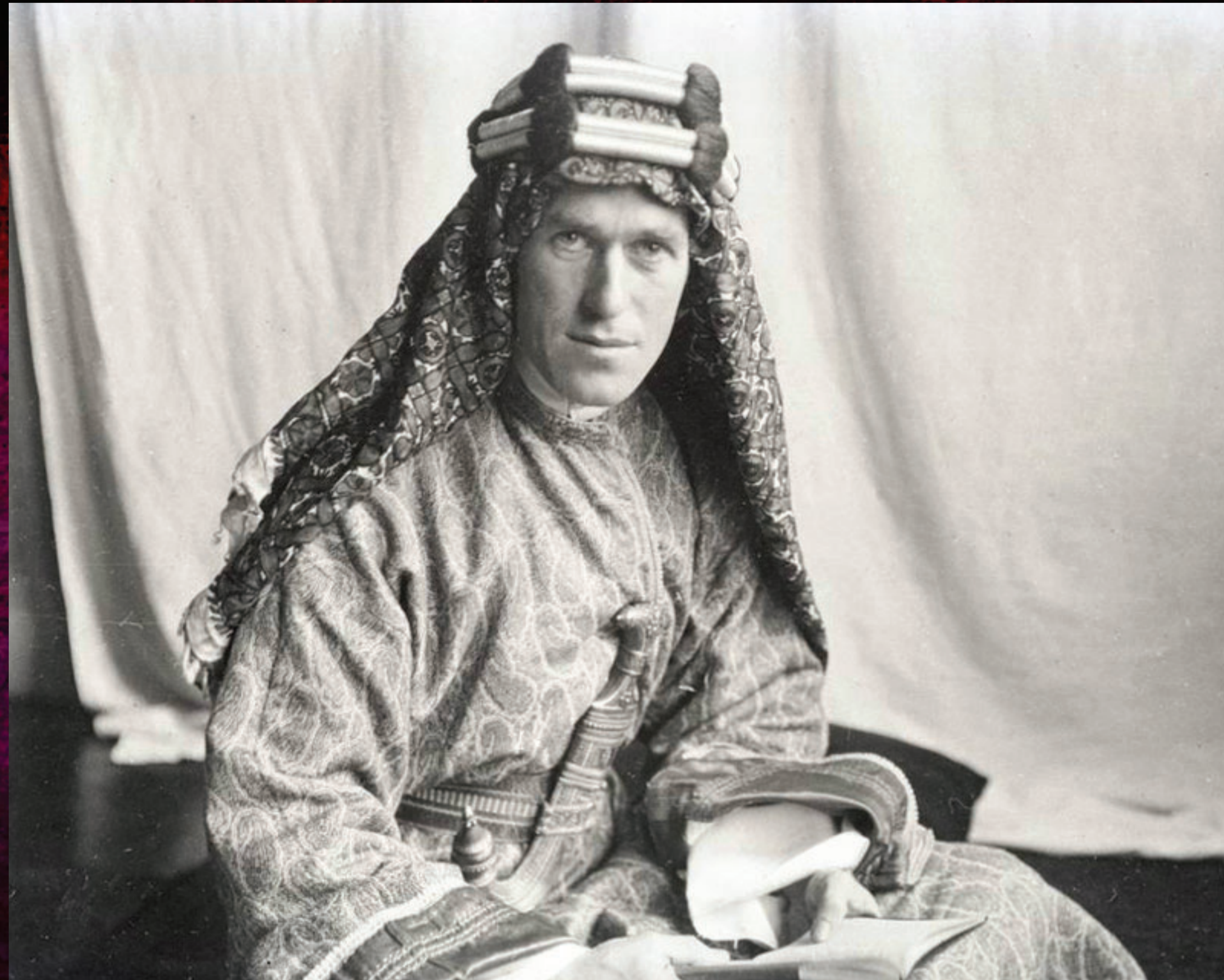
Thomas Edward Lawrence - Lawrence of Arabia

British archaeologist, army officer, diplomat, and writer