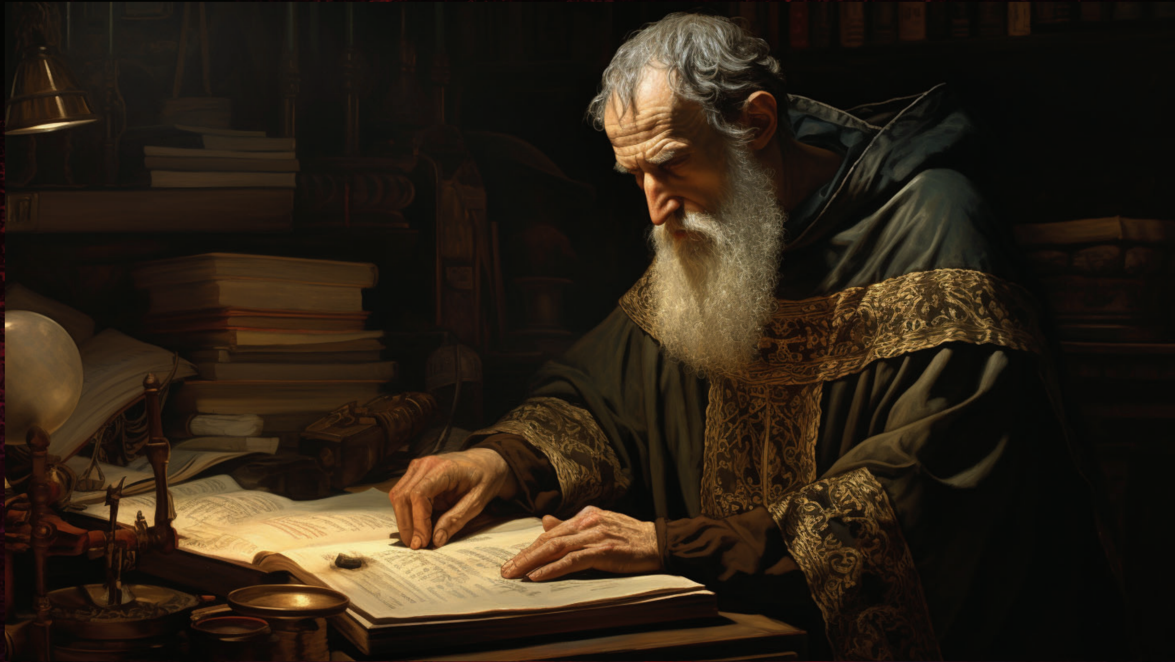
Augustine of Hippo Rendering