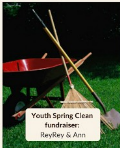
Youth Spring Clean fundraiser: ReyRey & Ann