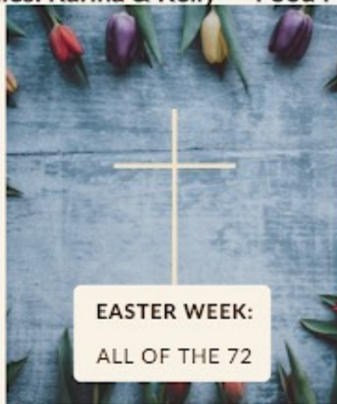
EASTER WEEK: ALL OF THE 72