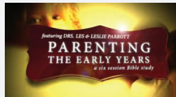
Parenting: The Early Years by Les & Leslie Parrott https://www.rightnow.org/Content/Series/122