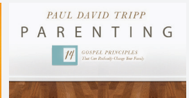
Parenting by Paul Tripp https://www.rightnow.org/Content/Series/303205

These resources may be used individually, but are ideally used within a community or small group context.